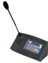
PPM-IT5 Touch-Screen IP/SIP Paging/Intercom/ Control Console (PoE/24VDC)