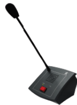
Terra-TK IP/SIP Desk-Top Microphone with PTT Switch (PoE/24VDC)