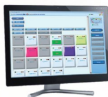
Terra-Manager Customer GUI age/Control Software Suite