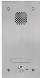
Terra-EX Full Duplex Door Station Over IP