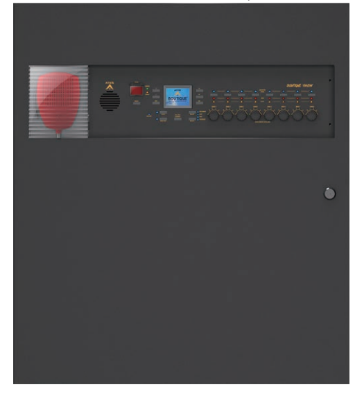
250W/500W Class-D amp & battery charger built-in