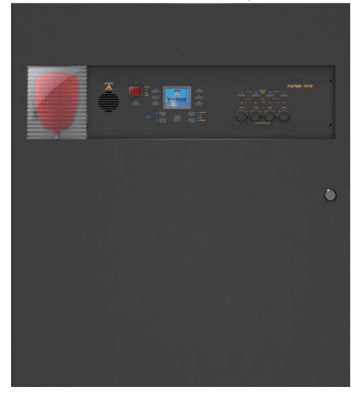
250W/500W Class-D amp & battery charger built-in