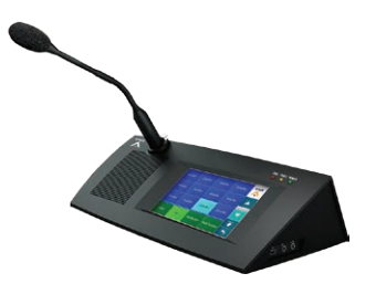
DPM-T5 5" TouchPanel Paging Mic Console